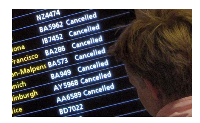
Figure 3: Flight cancellations across Europe were widespread.

ena that impacts societal activity (i.e. volcanic emissions impacting the safety of passenger aviation). The sUAS will provide targeted, in situ observations from previously inaccessible regions that can significantly advance NASA's goal of safe, efficient growth in global aviation by aiding in the collection of scientific data from which predictive Volcanic Ash Transport and Dispersion models (VATD) can be used to inform air traffic management systems.