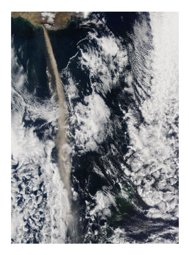
Figure 4: NASA's view of the plume from space.

greatly enhance the sensing capability of the platform, such as through the ability to obtain instantaneous spatial derivatives, or the ability to reduce the time required to sample an entire plume, providing a better understanding of the plume structure as it continually evolves.