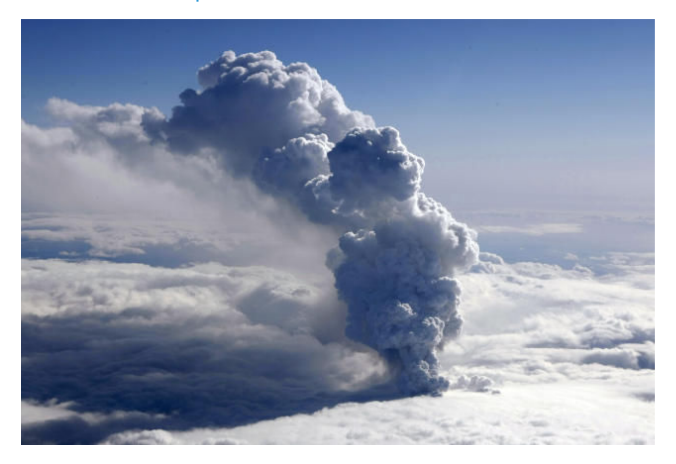
Figure 1: Aerial view of the Eruption of Eyjafjallajökull volcano.